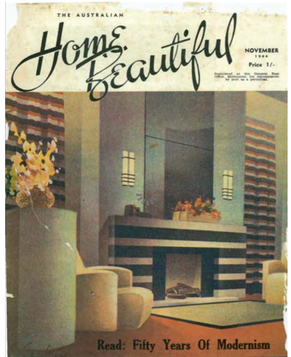
Australian Home Beautiful (November 1944, vol 23, no 11, p. 1)