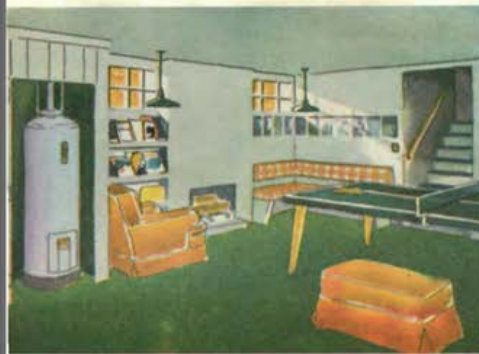
The Australian HOME BEAUTIFUL, April, 1953.