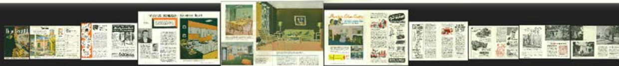
The Australian HOME BEAUTIFUL, April, 1953.

I expected to see more color used for interior painting in Switzerland. What I did see was quiet and pleasant like the country itself, nothing very striking or dramatic. I was shown over that great new hospital in Zurich which attracts hospital authorities