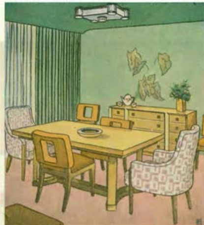
To increase the effect of space in this small dining room, walls, ceiling and curtains are all in the same pale green. The coral upholstery warms an otherwise cool scheme and monotony is avoided by covering two chairs in a light patterned material.