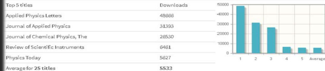
Chart - overall usage of top 5 v average

Publisher usage by title and year - JR1 report for A Dummy Institution (Publisher: AIP - American Institute of Physics, includes gateway/host usage Fully Open Access title, according to DOAJ, www.doaj.org )